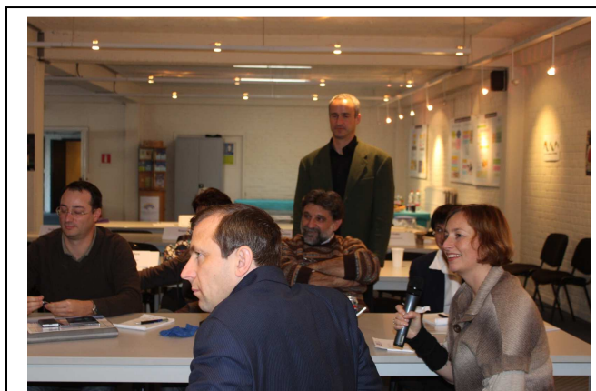
Working group at Tobacco Control Advocacy and Campaign Workshop

http://www.europeanleague.org/internet/en/page.asp?niv=2&SM=480&SM2=358&Sid=GP&lv=2